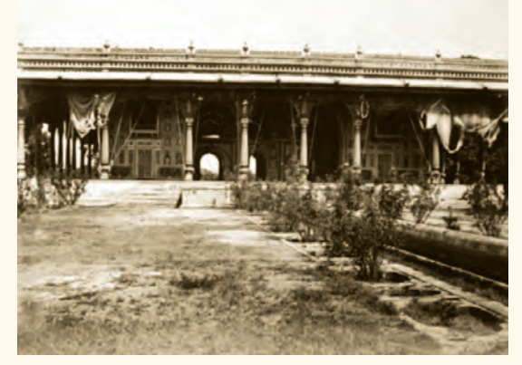
Daria Daulat Palace - 1860 photo

Under Tipu, Purnaiah continued as the Minister of Finance and was one of the strongest advisors, despite being the only Hindu in the Advisory Council. There were orders from Tipu advising his officers not to allow any non-Muslims in their secret consultations, with the exception of Purnaiah.